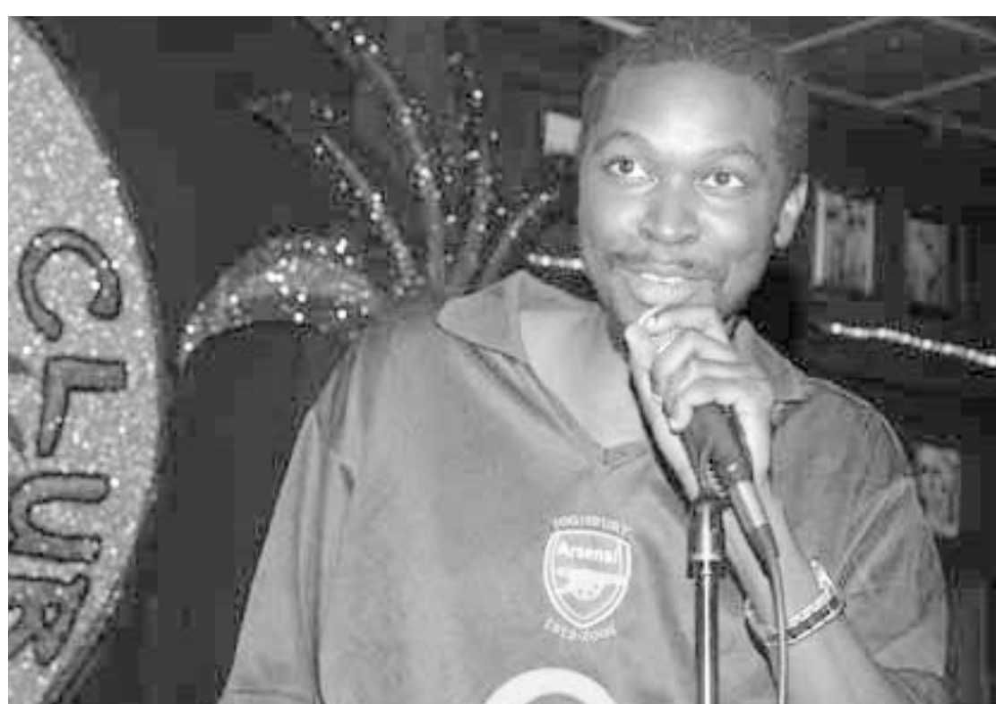
Ugandan poet Dickson Wasake takes the mic.